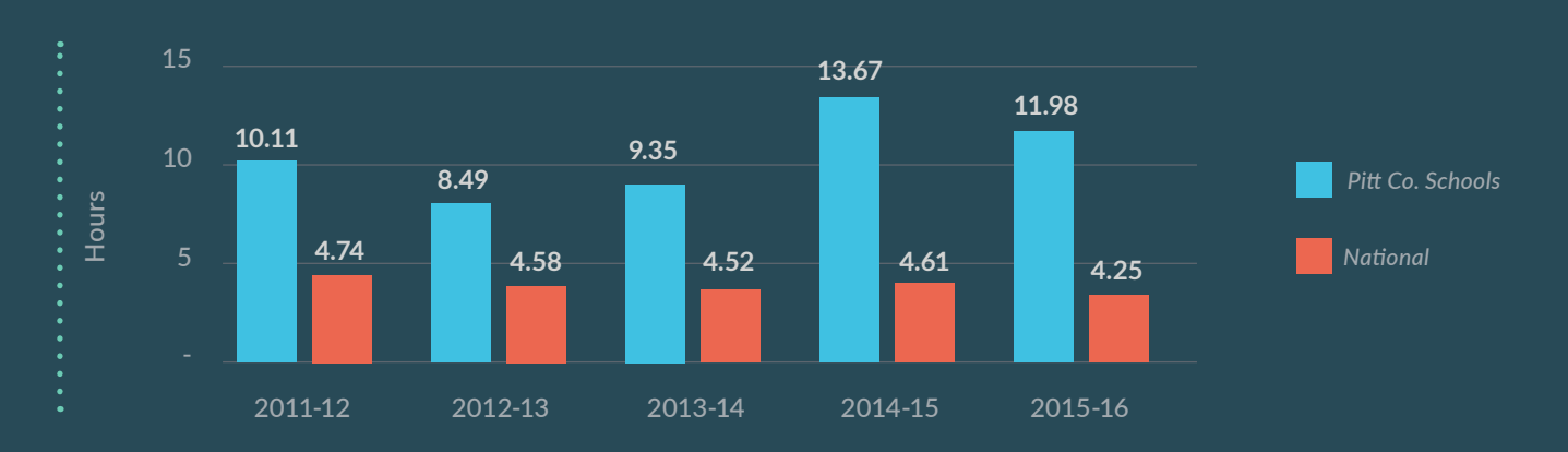
Figure 5: Average Number of Hours per Enrolled Activities by Year

Pitt County Schools leaders decided to align their metrics according to whether professional learning activities included substantial time and approaches for teachers to adequately master the knowledge and application of specific content. As a starting point, they sought to recognize only enrollments of greater than ten hours in their continuing education credits. The chart below demonstrates their progress toward driving up the length of learning engagements over the last few years.